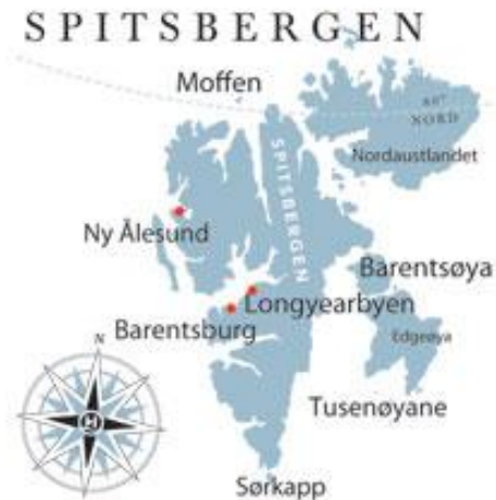
Location of Longyearbyen, Spitsbergen (Svalbard).